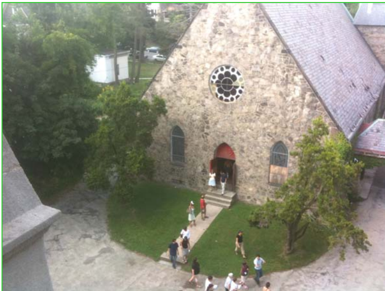
ABOVE: Aerial view of guests touring one of the buildings at the St. Peter's complex in Germantown on June 25th.